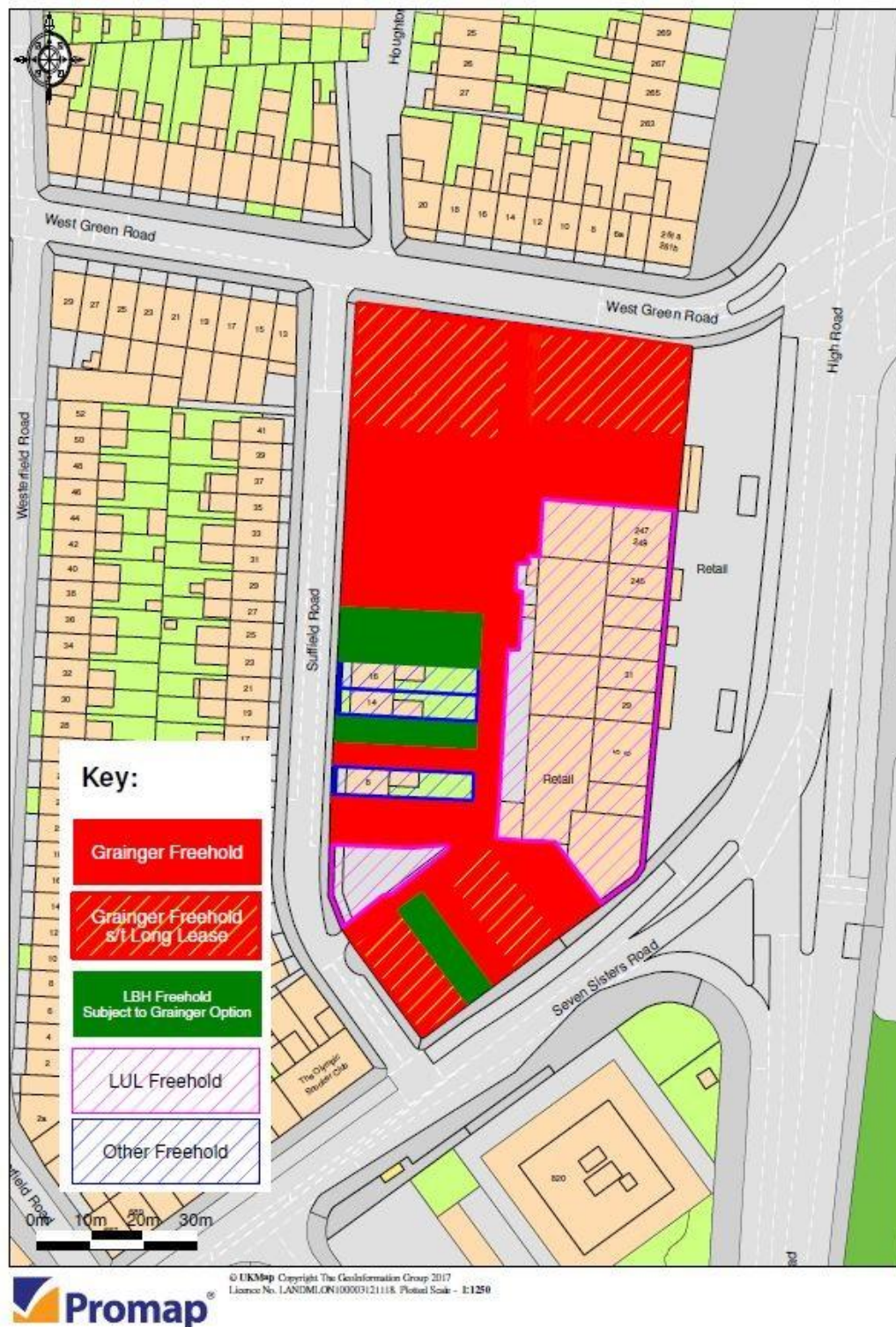
FIGURE B: Site Ownership map (as of August 2018)

Wards Corner site - Past, current and future uses of buildings